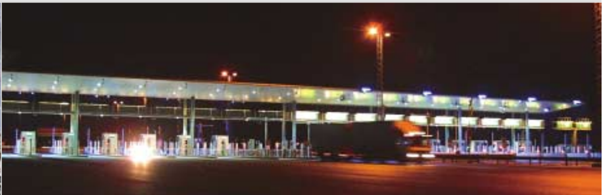
Toll station of the Great Belt Link.