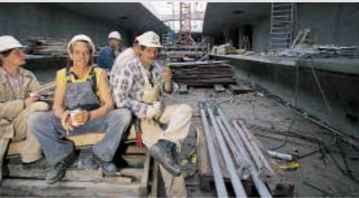
Contractors work in unison towards the common goal: the completion of the project within budget. The client, however, must be firmly in charge.