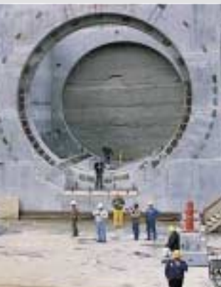
the Great Belt.