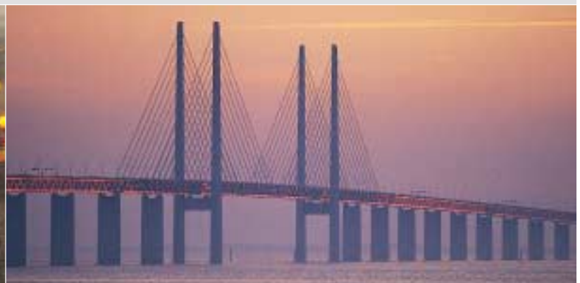
The 8 km long cable-stayed bridge across Øresund.