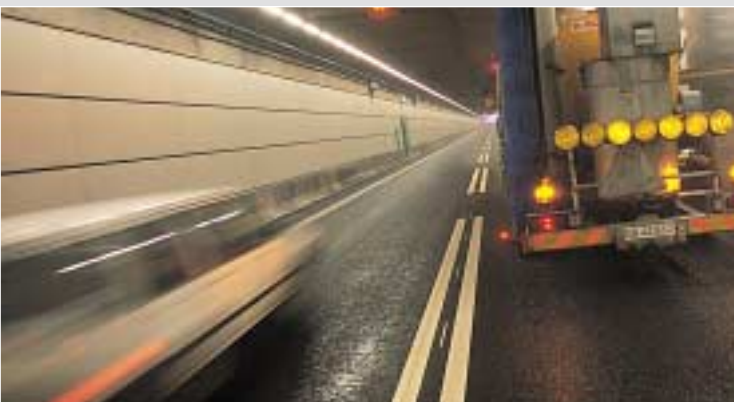
The 4 km long immersed tunnel under Øresund is the world's first immersed tunnel to be cast in a factory on-shore.