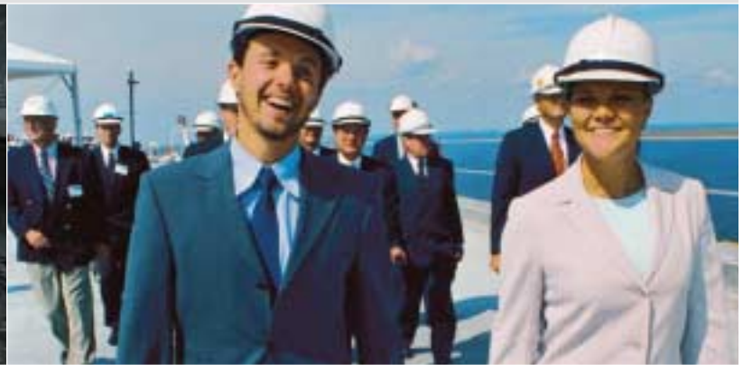
Managing emotions through events can be a part of clearly set-out communication strategies. The princess of Sweden and the prince of Denmark meet at the Øresund bridge prior to the opening of the link.